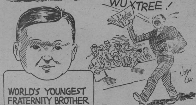
THE HEIGHTS DAILY NEWS STAFF OF NEW YORK UNIV. DISTRIBUTED 30,000 COPIES OF THEIR PAPER AT THE N.Y.U.-FORDHAM GAME LAST FALL IN YANKEE STADIUM. IT WAS THE LARGEST SINGLE ISSUE OF ANY COLLEGE PAPER.