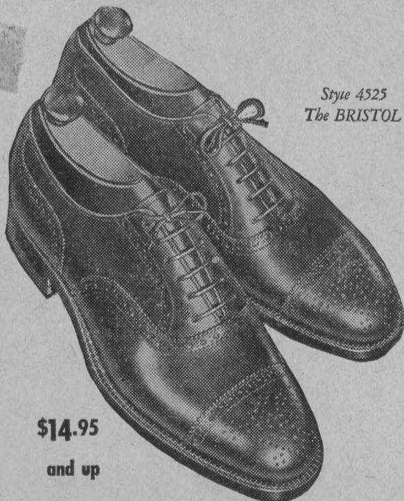
Style 4525 The BRISTOL