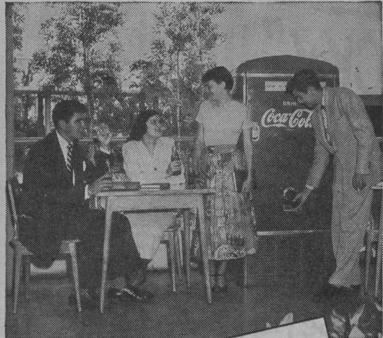
Student Club University of Miami Coral Gables, Fla.