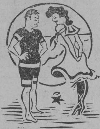
SENIORS PICNIC Gaucho Beach Club