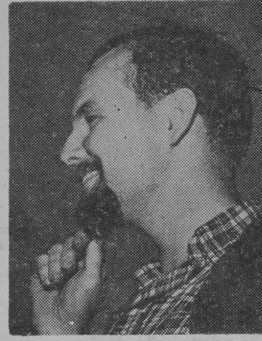
Men! You too can look like this. Cultivation for Whiskerino contest starts today, ends May 7, when all products will be judged at the AMS steak fry.

against a wall, however, for we can see in the future a better situation as exemplified by such schools as San Jose State, College of the Pacific, and the University of Nevada.