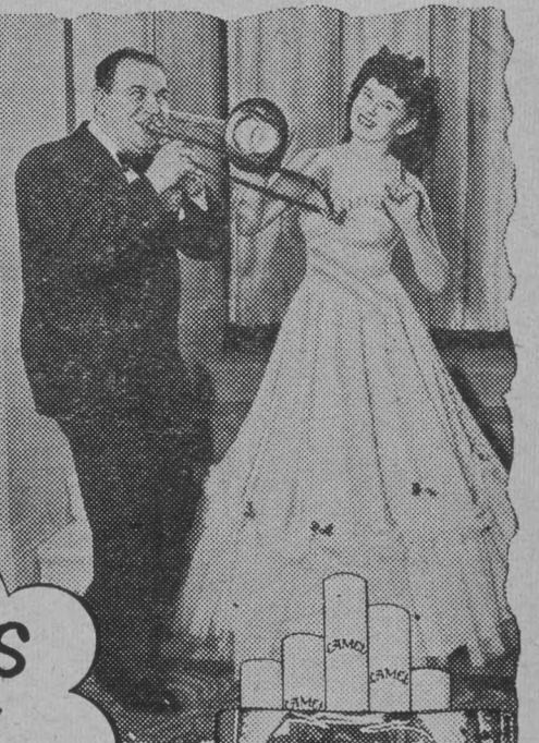
R. J. Reynolds Tobacco Co., Winston-Salem, N. C.