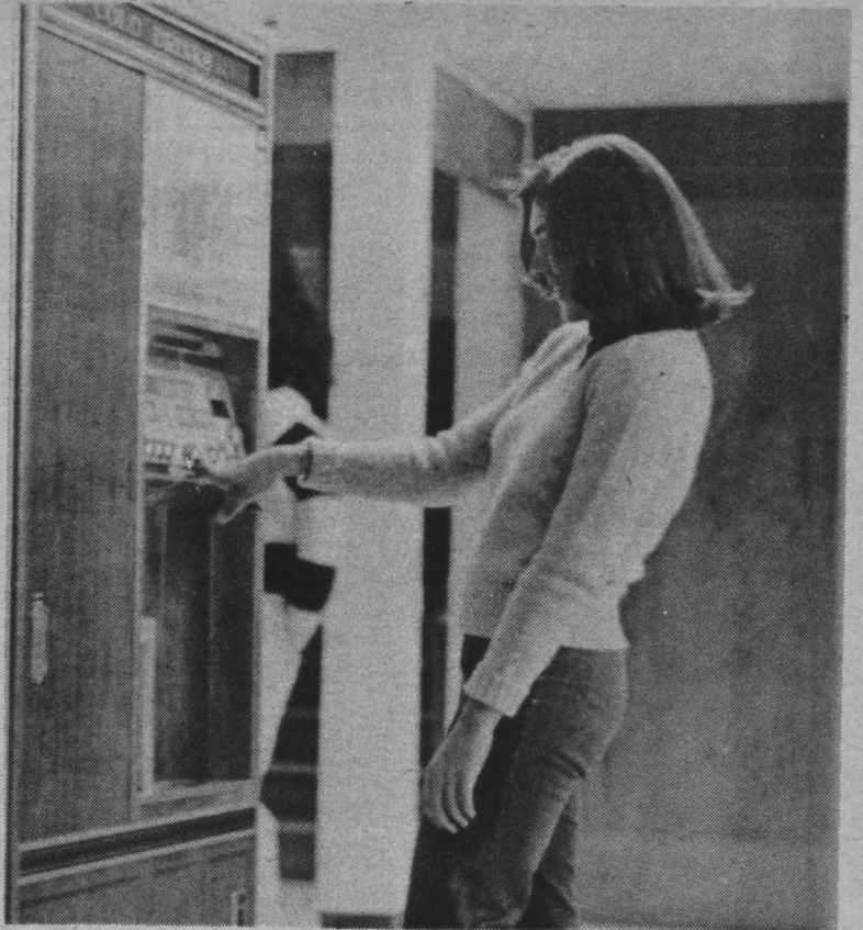
A UCSB co-ed casually accosts a drink machine as yet unaware of the ramifications of her action. Thousands of transactions such as this one occur everyday, making this a profitable business. Some of the revenue generated in this manner is fed back to the residents in various forms.

This is something to think about next time you pay 40 cents for a Zinger!