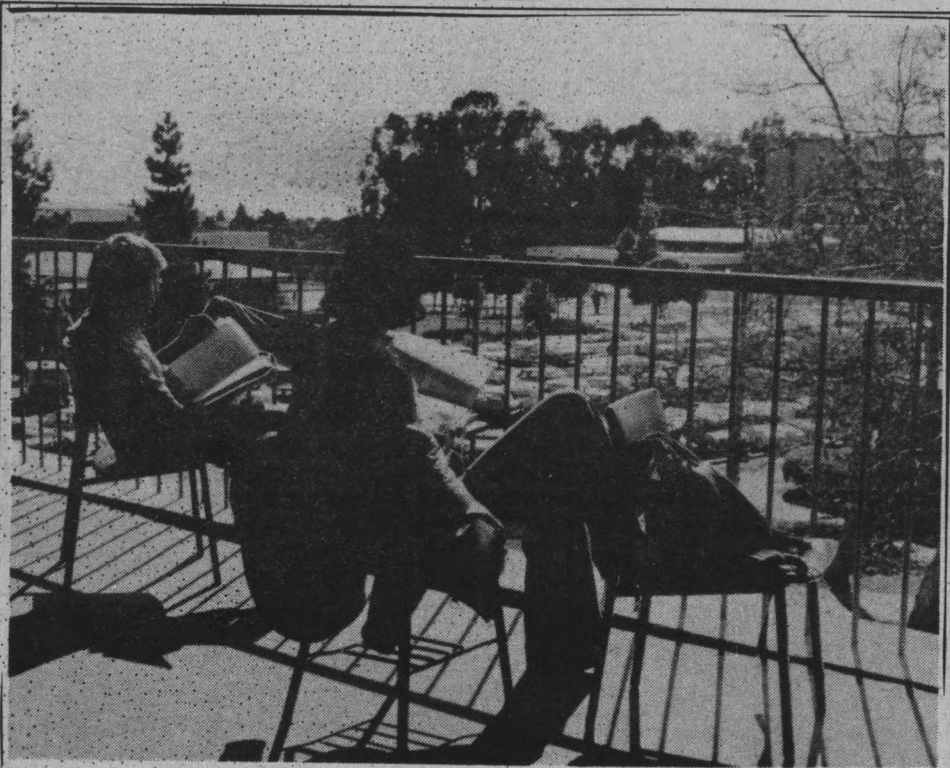
With the rain temporarily gone from UCSB some students took the opportunity to study in the sunshine. This studious pair enjoyed the view from the new wing of the library.