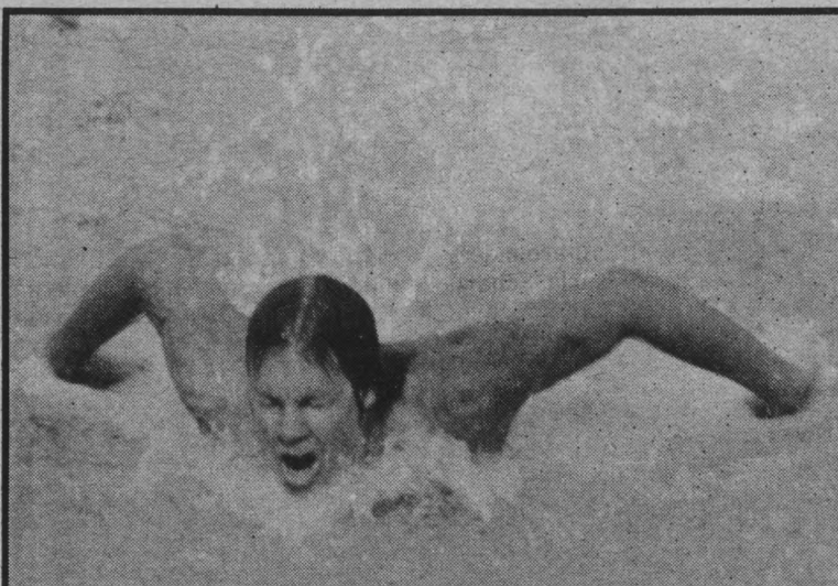
THE MEN'S SWIMMING TEAM finished their dual meet season over the weekend by defeating visiting San Jose State and the Aquabears.

Thus, the men's team showed considerable improvement in three of the six events including floor exercise and rings, where four out of five improved their scores, and vaulting three out of five improved.