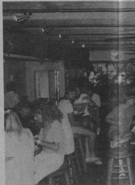
The Scoop: Happy Hour Monday through Friday for all drinks (including 12 oz. domestic beer).

If you're willing to pay, you can always play at Hola Amigos' happy hour. Not only are the drinks pretty expensive, but a good deal of the food has some kind of price tag as well; oysters for 35 cents, two shrimp for 50 cents and fajita tacos for 50 cents each. After paying though, the fajitas are great. The place lacks character, but lively crowds and a nice view help to lighten things up a bit.