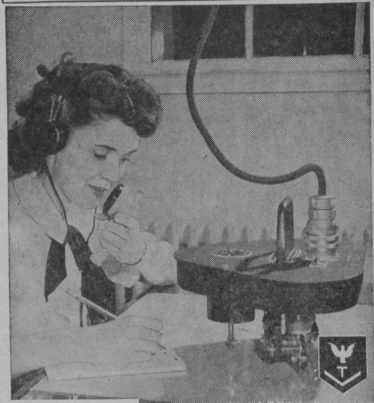
This WAVE—and hundreds like her—helps keep 'em flying. She's an important cog in the machinery which makes Navy fliers. As a Link Trainer Instructor, her job is to give directions to fliers, seated in cockpits of stationary training planes. The instrument in front of her, called a "crab," records how well the pilot carries out those directions. As a result of this kind of training, hazards are greatly reduced for pilots when they go aloft. The inset shows a rating badge worn by Link Trainer Instructors, the "T" meaning teacher. A new booklet about the WAVES is available at Navy Recruiting Offices.