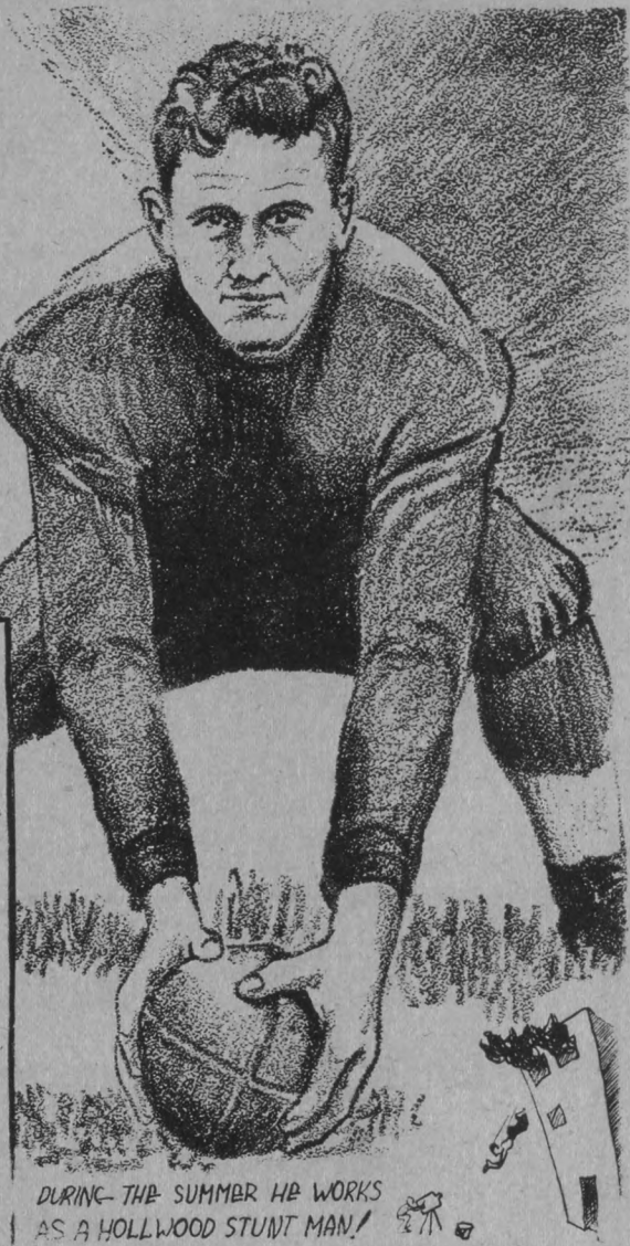
DURING THE SUMMER HE WORKS AS A HOLLYWOOD STUNT MAN!