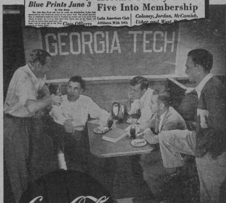
Georgia Tech College Inn Atlanta, Ga.

Koseme Society Elects Five Into Membership