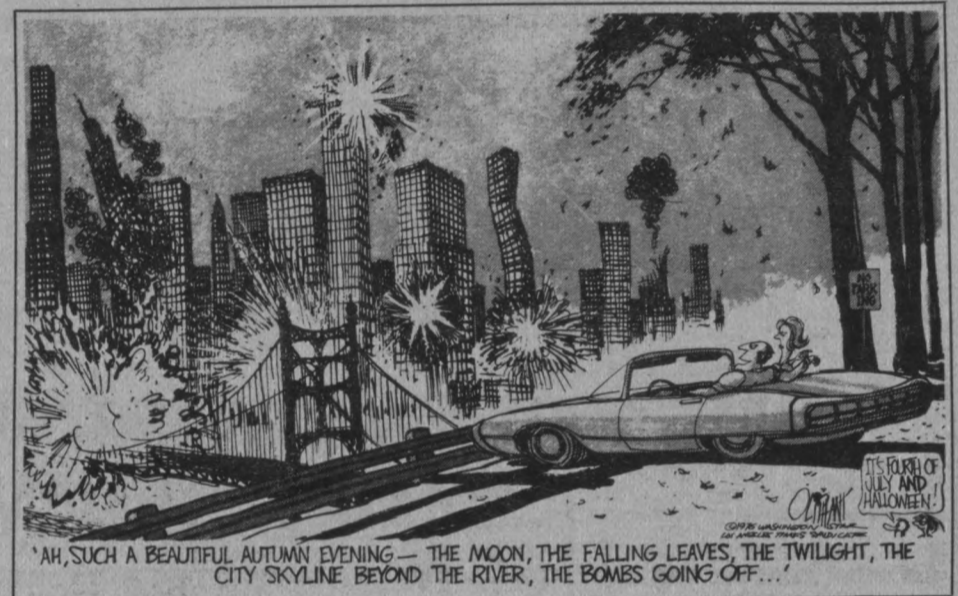
"AH, SUCH A BEAUTIFUL AUTUMN EVENING— THE MOON, THE FALLING LEAVES, THE TWILIGHT, THE CITY SKYLINE BEYOND THE RIVER, THE BOMBS GOING OFF..."

Because of the water moratorium, development is at a standstill, and thus the cost of land in I.V. is at an all time low. This, coupled with the reality of a monthly increase in rent of only 57-76 cents per renter, shows the bond to be financially desirable. But it is also urgent. Big money interests are threatening, by challenging the incumbents of the Goleta Water Board, to lift the moratorium and thus submit Isla Vista to out-of-control apartment-raising. Our town would sag and suffocate under the strain and pollution of more cars, noise, and people. No one wants that.