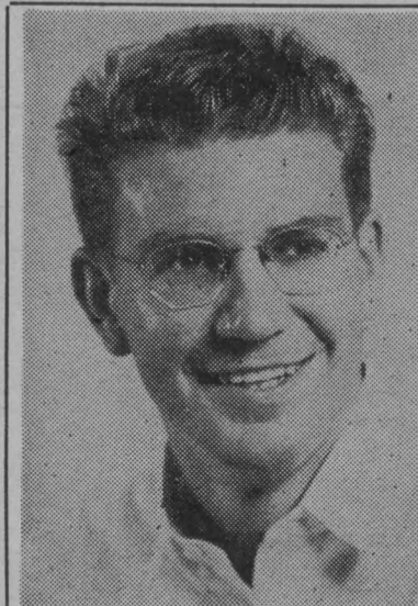
Zane Studio Photo

1309 state street • santa barbara • california