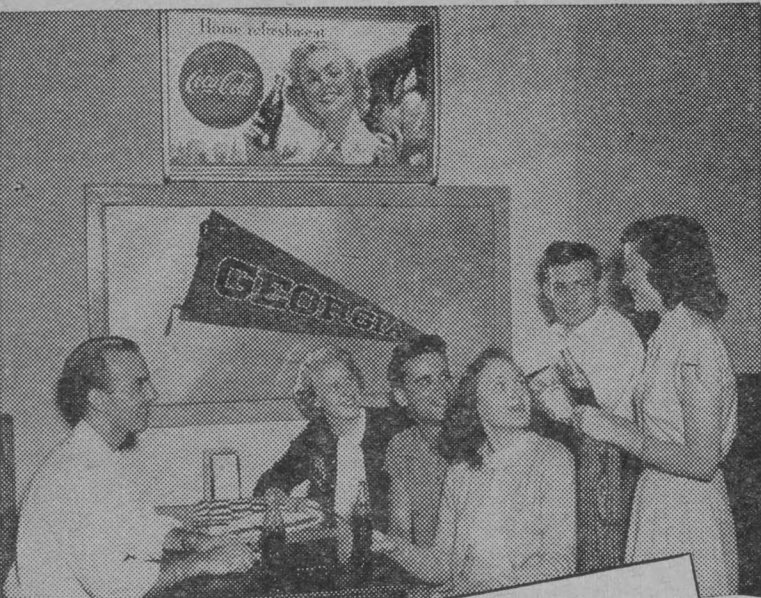
University Store Athens, Ga.

This Offer Good Only Through November 2, 1949