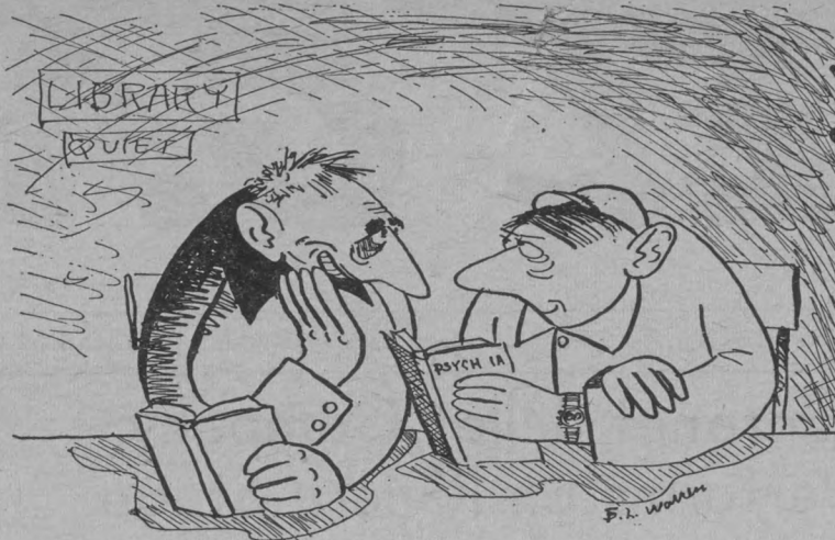
"Psst, — Wanna See the Tiger?"

4135 N. HOLLISTER Full Course Dinners 75c Includes: Soup, Salad, Entree, Potatoes, Vegetable, Rolls, Dessert, Coffee 10% Reduction to Students on our Weekly Boarding Plan