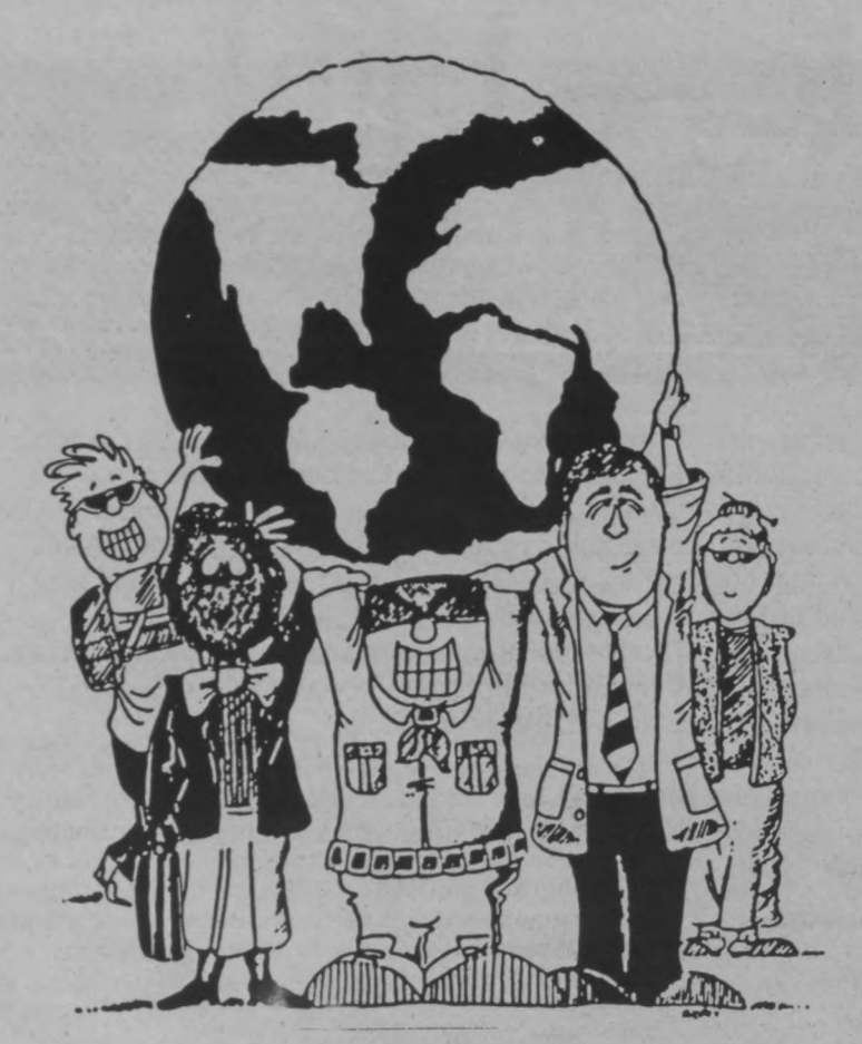
VOLUNTEERS give the world a lift!!! BE ONE