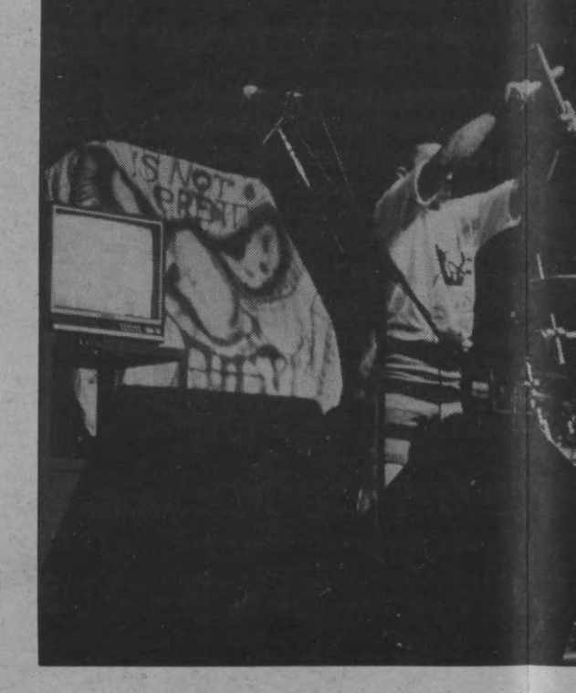
Program Board brings the best in live

CONTROLLER: The controller is responsible for assisting Legislative Council with their accounts, analyzing proposed capital expenditures, advising Boards and Committees on the formation of a budget, and advising on overall increase of cost effectiveness.