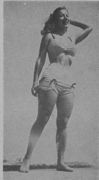
bathing suits with many charms

new billowy look . . . rompers, be-ruffled top and bottom, cinched in at the waist by yards of sash . . . calico print . . . black dots on dazzling backgrounds . . . yellow, coral or green. . . . .13.75