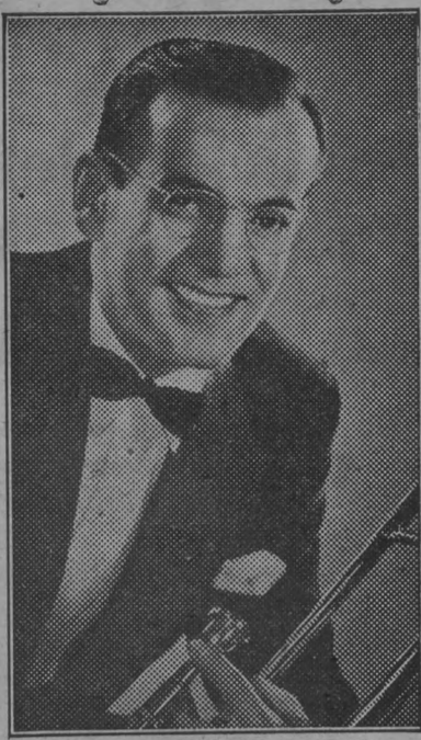
GLENN MILLER, New Dance King, now broadcasting over Coast-to-Coast C.B.S. Network, three times weekly, for Chesterfield.