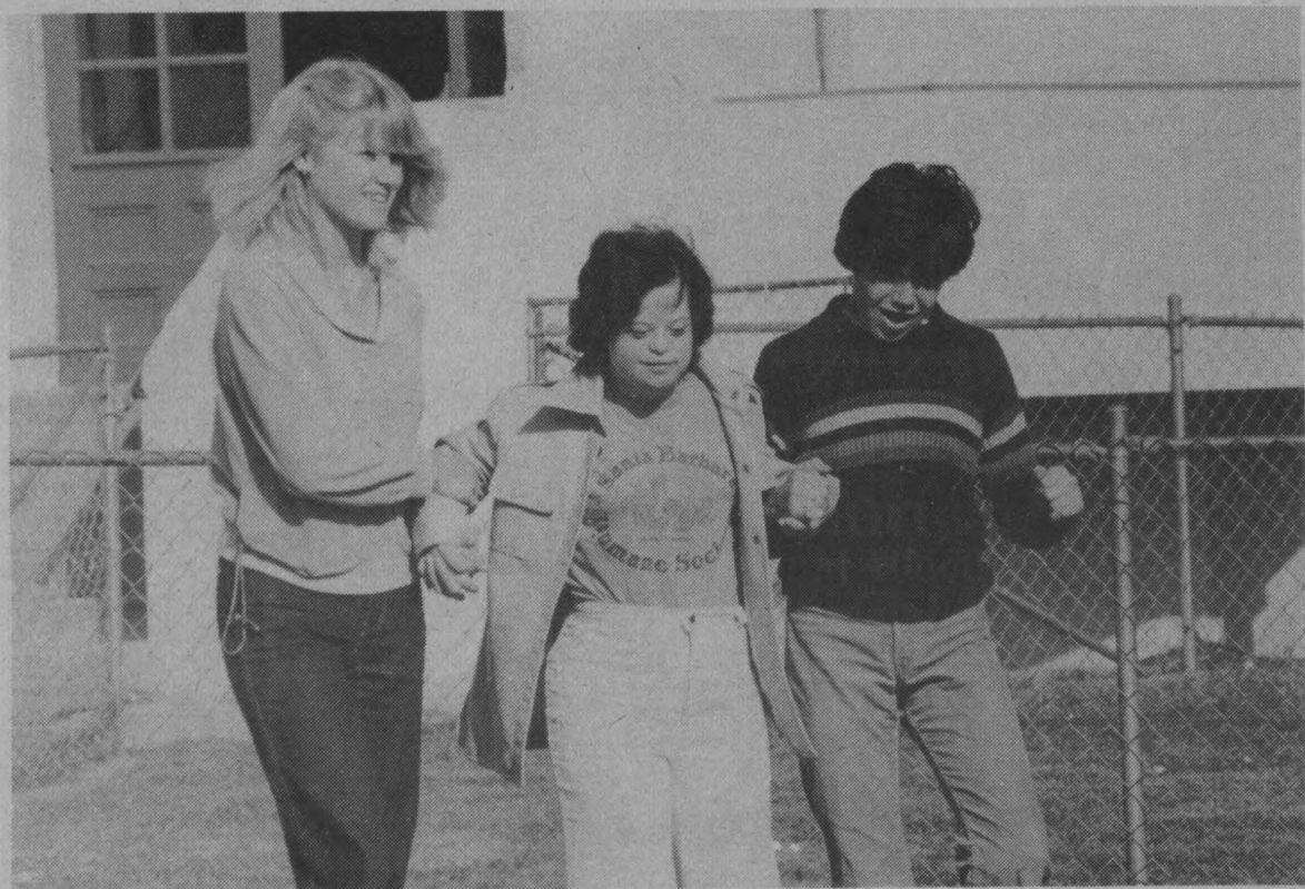
When you help with the special children, a special feeling of accomplishment will be your reward.

CAB is a constantly growing organization of volunteers, with endless possibilities for new projects. CAB and the community need you and your ideas. If you don't see the project you want to volunteer for, but know there's a need... let us know, so we can help you and the community.