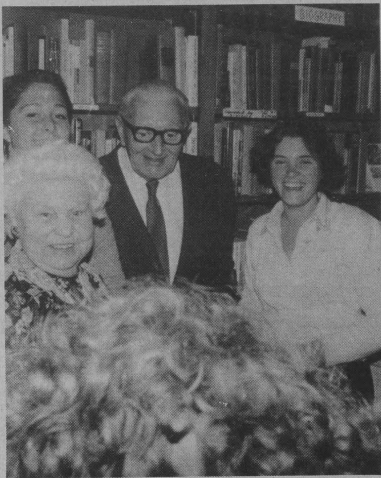
Everyone has a great time at the Valentine's Day Tea at Friendship Manor.