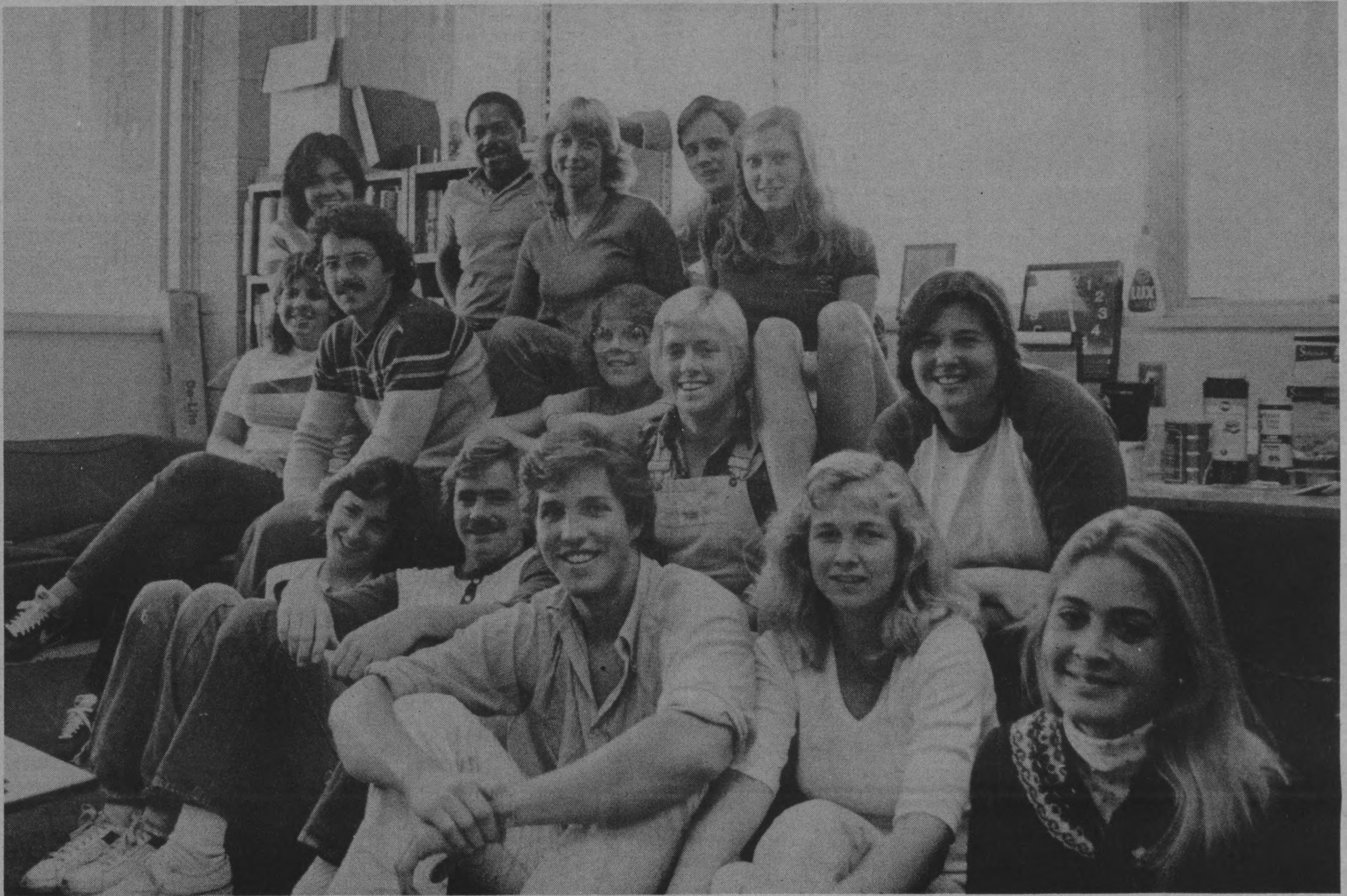
The CAB gang is ready and waiting to serve the students and the community.