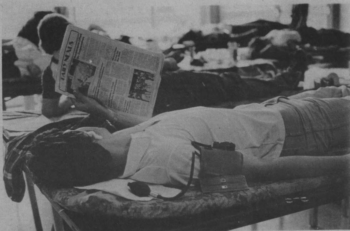
Give a pint and help those who are in need at the annual Fall CAB Blood Drive.

Because of the annual Blood Drive sponsored by CAB's Medical Project, Associated Students has an account of over 1,500 pints of blood that is available upon need for UCSB students and their families. For more information, drop by the CAB office or contact the A.S. Executive Director.