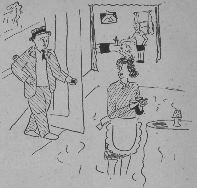
"I wish you'd speak to Junior, dear. He's been quarreling again."