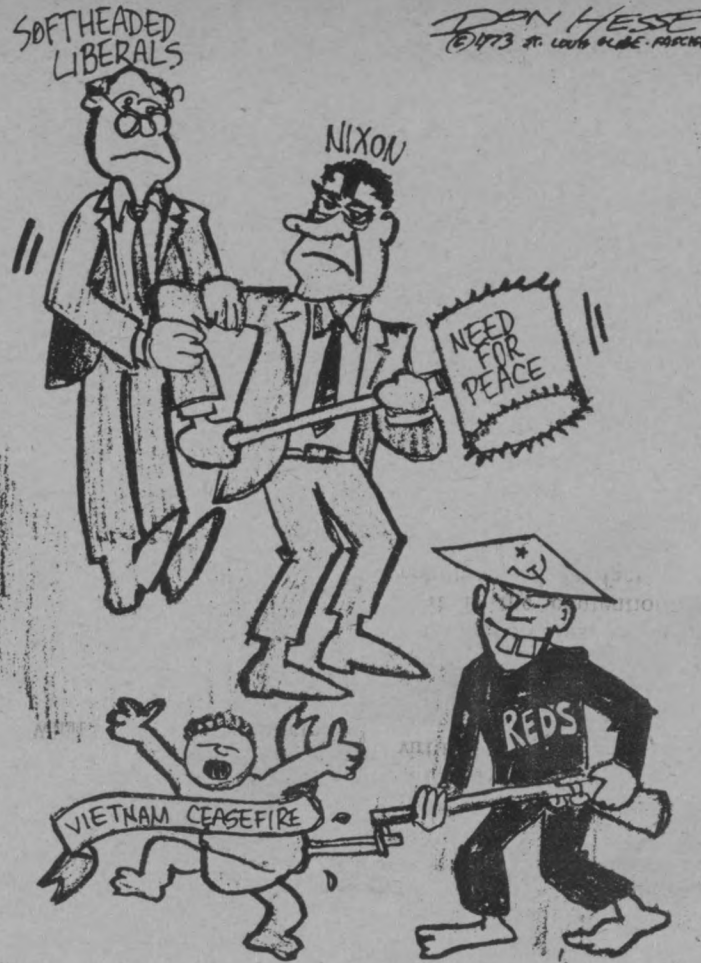
'You're just lucky I'm smashing this gook instead of you'

Would they have survived if their upbringing had been more permissive, less steeped in America's ethos? I doubt it. The work ethic inures our young to a hard, seemingly pointless (though we know better) existence while still in school. Take away the work ethic and what would America have left? I guess pretty much what the "free love" generation thinks is important.... ..doom.