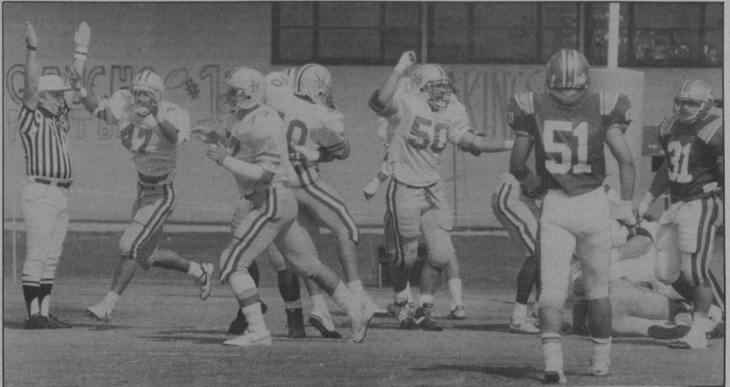
Nihilist File Photo

"I'm sick and tired of our department being treated as a