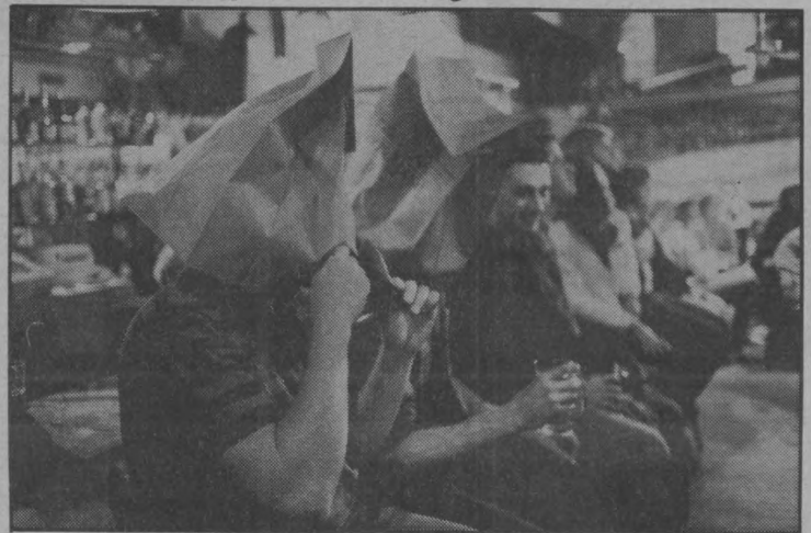
Nihilist File Photo

PAPER OR PLASTIC?: Gaucho Basketball Fans Anonymous (G.B.F.A.) members are pictured here at one of their weekly meetings. Locations of the meetings are secret.