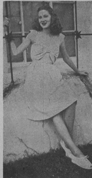
wonderful with tans

gay, fanciful, butterfly print on white pique—completely bare midriff—wide band of black at waist—narrow band of black catching up a scalloped neckline that is round and bare 13.95