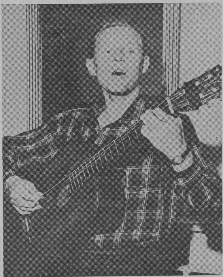
Richard Dyer-Bennet, the modern ballad singer with a versatile concert tenor voice and a repertoire of song-stories covering several centuries, will appear at the Lobero Theater on March 30 as a presentation of University Extension with the cooperation of the Associated Students and Santa Barbara College.

All organizations with meetings not on the Dean's Calendar by Thursday noon of the previous week will not receive publication space in the Tuesday issue of the Gaucho. For the Friday issue meetings must be in by Monday. These same times and dates apply to organizations who want their activities in the Campus Cuttings column.