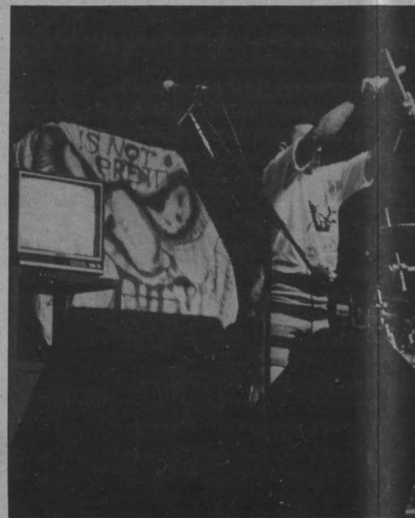
Program Board brings the best in live

CONTROLLER: The controller is responsible for assisting Legislative Council with their accounts, analyzing proposed capital expenditures, advising Boards and Committees on the formation of a budget, and advising on overall increase of cost effectiveness.