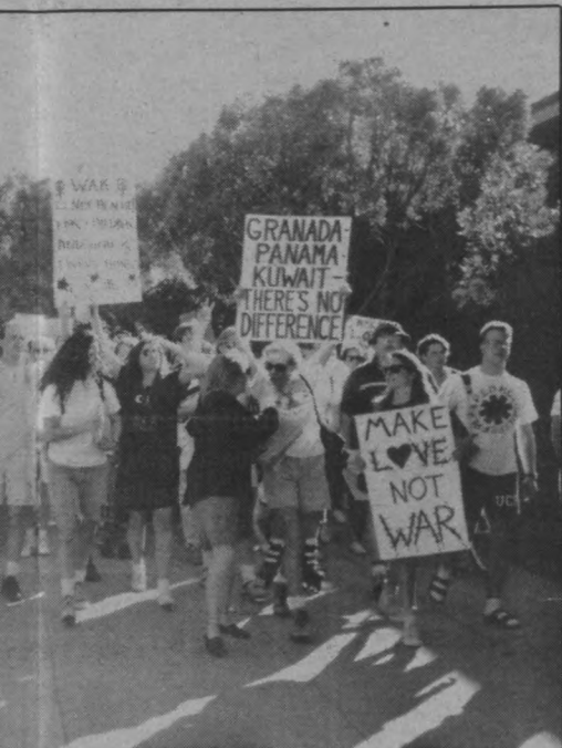
march. See students voice their opinions.