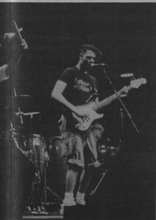
st in live entertainment to UCSB.

STORKE GOVERNING BOARD: The A.S. Storke Governing Board makes policy recommendations to the Legislative Council in the areas of the Communications Office, Storke Building maintenance, UCSB Map & Directory, and all other communications areas not specifically provided for by Press Council, Radio Council, and La Cumbre Excellence Board.