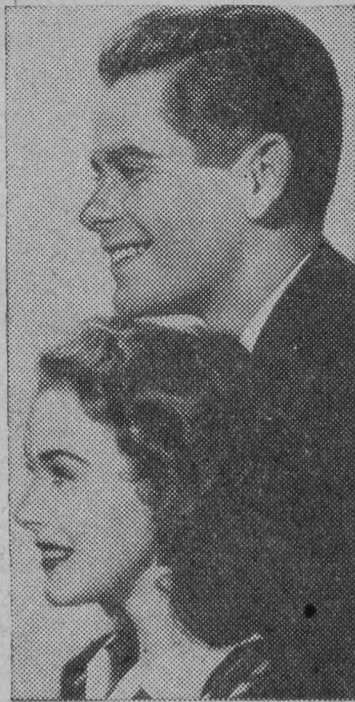
Glenn Ford and Marguerite Chapman are featured with Edward G. Robinson in "Destroyer" exciting saga of our fighting navy which opens today at the Granada theatre.