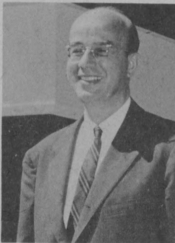
UC President Clark Kerr visits here this weekend.

They are delegates to the first of seven University conferences dealing with problems arising from California's population boom.