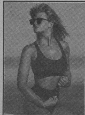
SOLID WORKOUT BIKINI Black, Jade, Fushia