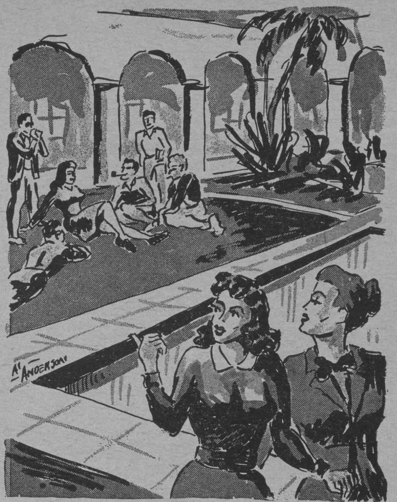
"Oh her? She cuts classes every day to work on her M.R.S. degree."