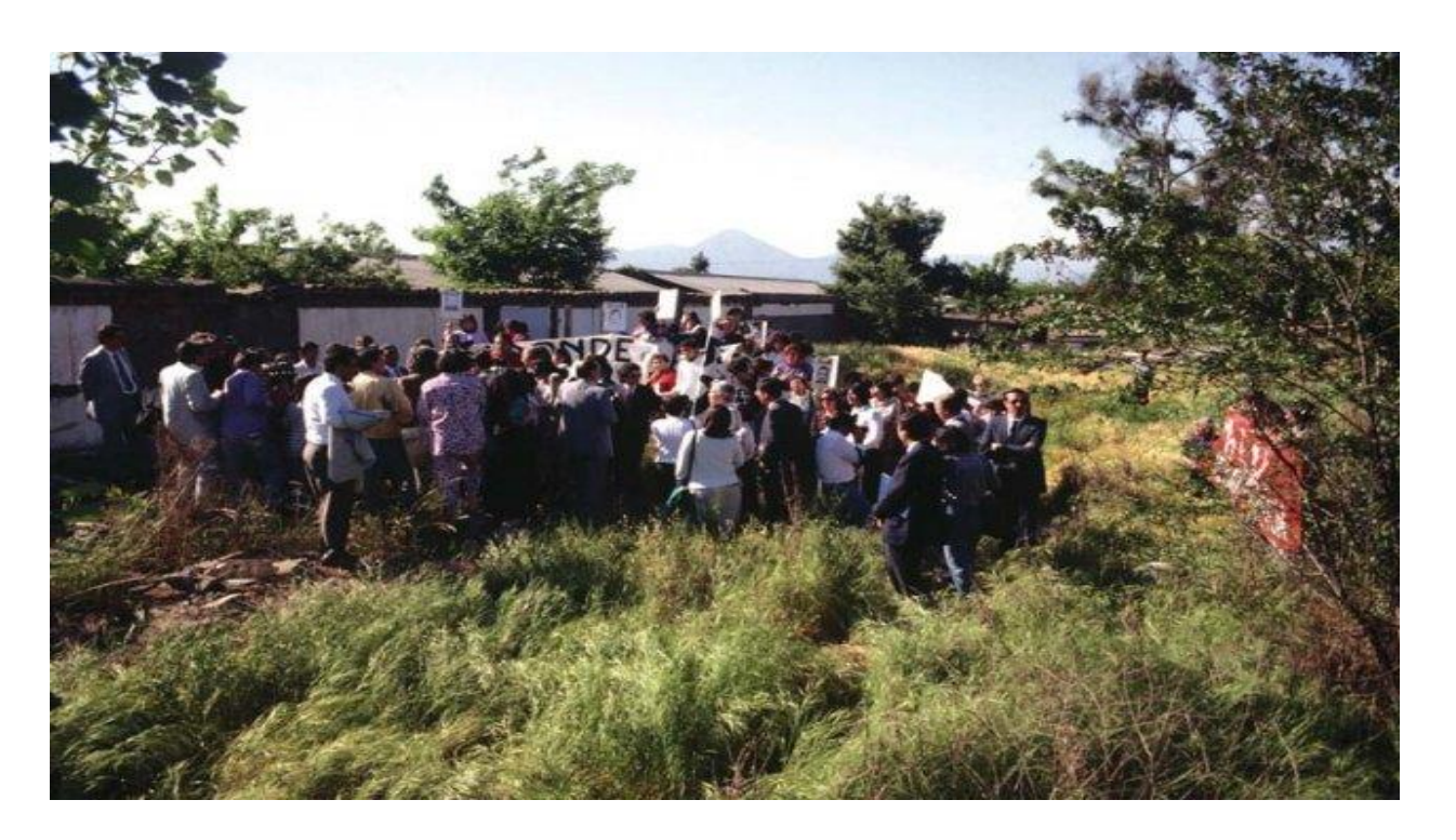
Figure 5. Recovery efforts at Cuartel Terranova, circa 1994.

terrorism.<sup>329</sup> Stake-holders inaugurated the now internationally recognized Villa Grimaldi Park for Peace on March 22, 1997. Since then, the former toxic site has turned into a leading steward in Chile's public battle over the memory of the human rights violations committed between 1973 and 1990.