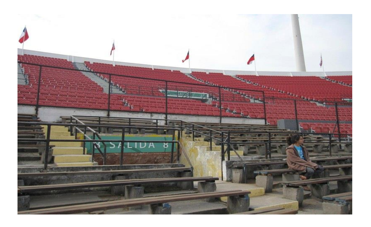
Figure 7. Preserved section of seating surrounded by modern upgrades for Chile's 2010 bicentennial celebration.

project National Stadium, National Memory, a host of other social actors also participated in the memorial process and narrative of the stadium-as-concentration camp. Finally, the increased interest and measurable uptick in public memorials beginning in 2003 brought the stadium's new and old stakeholders under great scrutiny and study. A growing body of social scientist literature, professional organizations, and state organisms began to discuss the stadium-as-concentration camp in terms of memorial patrimony, symbolic reparations, and democracy building. The lack of physical interventions to interpret the concentration camp continued to inspire activists and bring pressure on the state. By Chile's 2010 bicentennial, modernization efforts exposed the stadium's scar and exacerbated narrative controversies, whereas, for example, the annual velatón was marked by two separate ceremonies, the tradition encounter outside the gates and a new one inside the stadium proper, hosted by RMEPP.