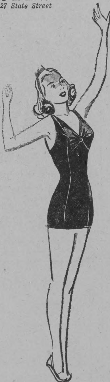
figure-molding Velvet Classic, featuring the Gantner twisted knot bra, and the Floating Bra uplift—5.95