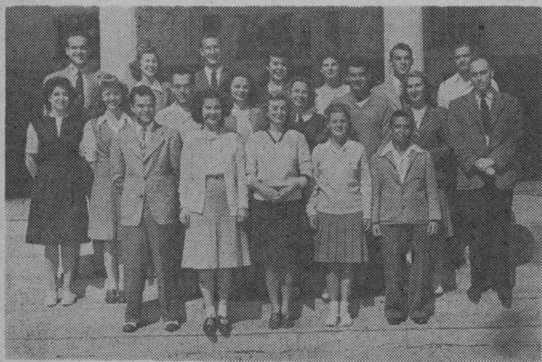
CALIFORNIA CLUB MEMBERS