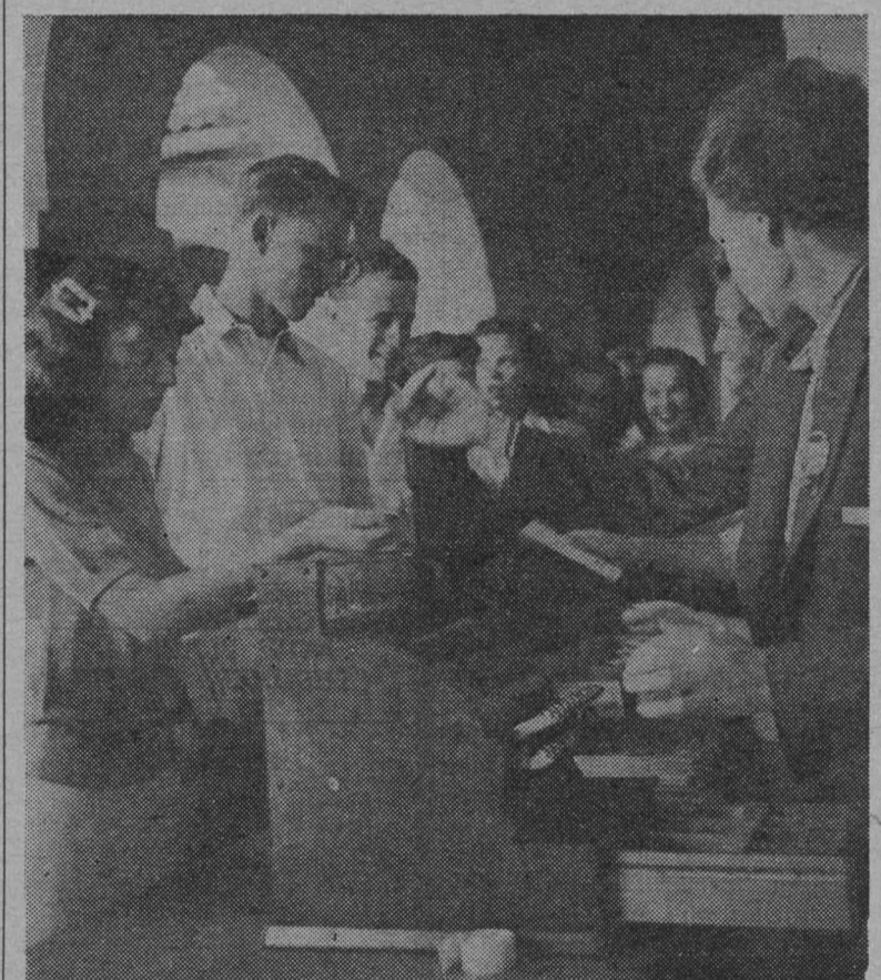
THE BOOKSTORE LINE turned out to be the worst of all for many. Frantic to beat the inevitable shortage of textbooks, people stood in line for hours on end—waiting.

These are the plans—with your help they will put into effect soon.