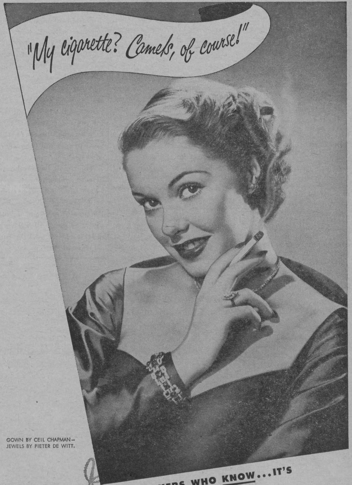
GOWN BY CEIL CHAPMAN—JEWELS BY PIETER DE WITT.