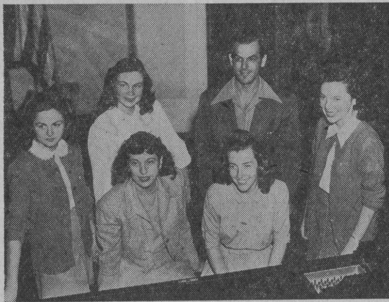
THE CAST OF ELIJAH takes a well-earned breather during rehearsal and poses for the cameraman. Outstanding voices amongst this group promise to make the musical oratorio production one of the most memorable yet seen at Santa Barbara College.

From reports from previous years, these trips are certainly a worth while project, and it appears as if this year's will be no exception to the rule.