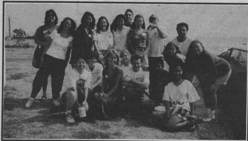
Make long lasting friendships - The 1994/1995 CAB Members