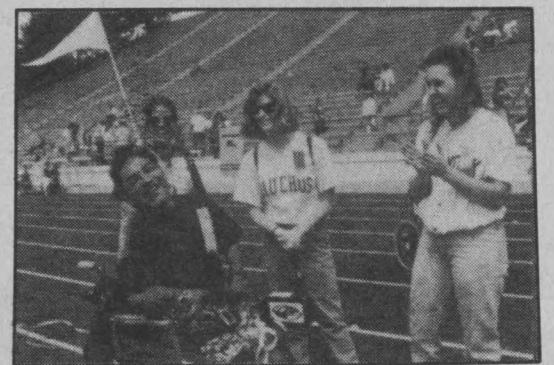
Special Olympics Track & Field meet-1995

"Not only did I gain valuable work experience through volunteering, but I have taken with me a much larger view of the world. It allows me to empathize, if not understand the challenges that so many people in the world face.