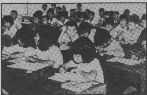
Village children fill a classroom. The orphanage sponsored by the Squires-1967

"I wanted to do something for them (senior citizens) and to make them feel like they weren't forgotten. The baked goods drive for low-income senior citizens was a huge success. It showed me that collective action can sure go a long way!"