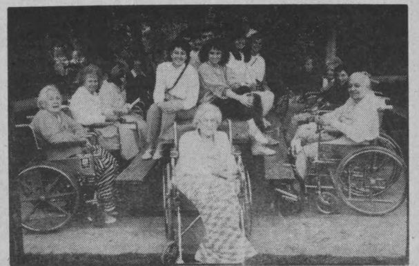
An afternoon outing with local senior citizens-1987

"I started volunteering when I was a Freshman at UCSB. I wanted to get involved while I was at school so I became a Special Olympics volunteer. I really enjoyed the work I did and became more involved with CAB as the years went on."