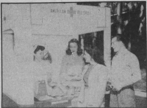
The American Red Cross helping out-1946

Volunteerism has been an integral part of UCSB since the school's founding in 1945. From blood drives and beach clean-ups, to helping children in far-away countries, UCSB volunteers have never shied away from a challenge. For half a century, volunteers have learned that the greatest reward is not what you give to others, it is what you receive in return.